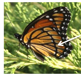
Vicerov Median line