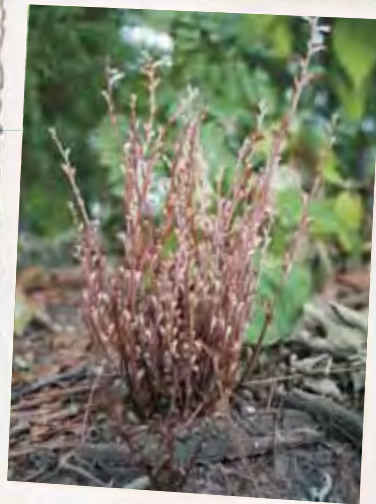
Photo: Beechdrops ( Epifagus virginiana ) taken by Phillip Merritt

The plant is well-named, Epifagus derived from the Greek epi , meaning "upon," and phagos , "the beech." A tea made from the fresh plant was once used for diarrhea, dysentery, mouth sores and cold sores. Also known as "cancer root," the plant was used in folk medicine as a cancer remedy, but recent tests for antitumor activity proved negative. For more information about native plants visit www.claytonvnps.org .