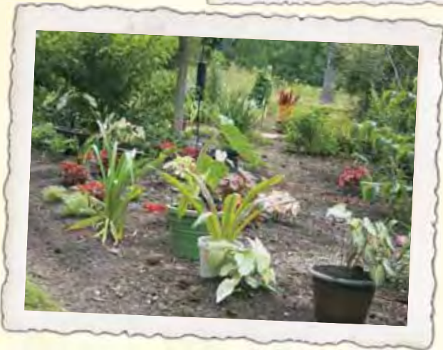
▲ Late Summer