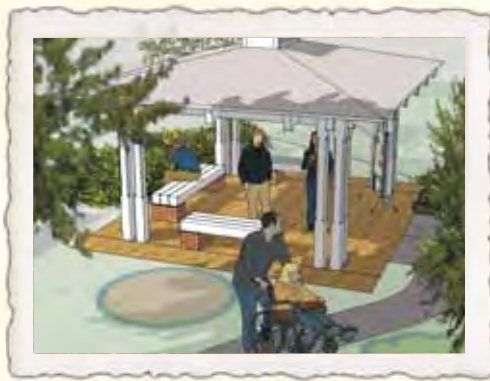
▲ Carlton Abbott and Partners, P.C.